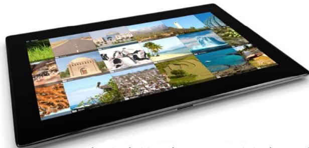
SiteAudit Visualizer runs on Windows tablets and workstations